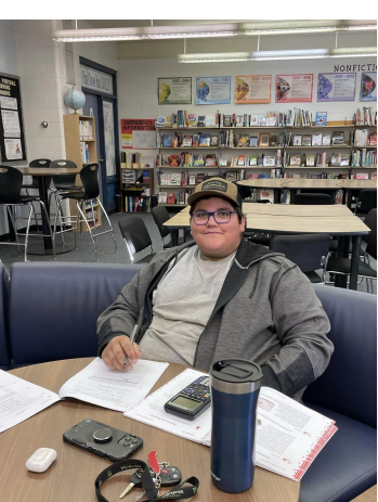
World Students' Day is celebrated every year on October 15th!