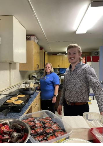
May Food for Thought Breakfast Program Volunteers STAT Energy, Vision Credit Union and Terra Goodzeck!