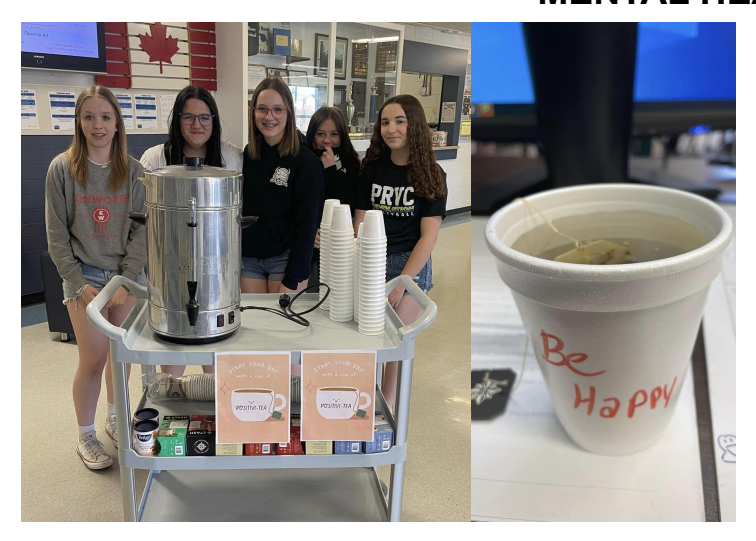
Our Students Against Destructive Decisions (SADD) students delivered cups of Positivi-Tea!