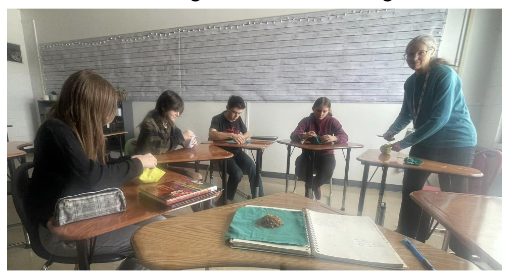
Aboriginal Studies 10 students learned about and prepared protocol to be given to our presenters sharing their knowledge and gifts with us during our Indigenous culture week.

Knowledge Shared Through Culture Week Activities