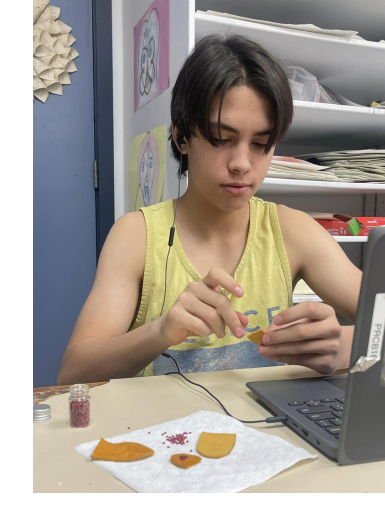
Art 9 and Art 10/20/30 classes learned how to bead.