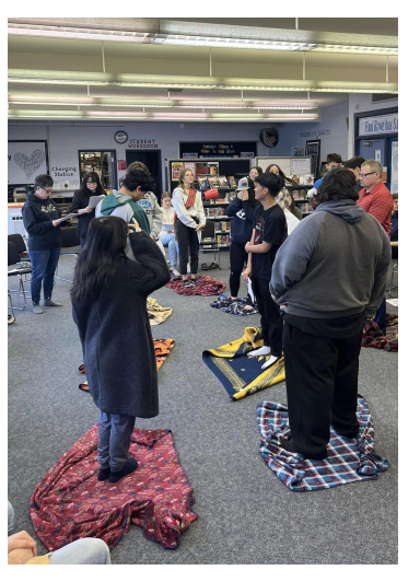
Grade 11 and Grade 7 classes each participated in the Blanket Exercise - a powerful, interactive exercise to learn the history of Turtle Island and Canada's history.