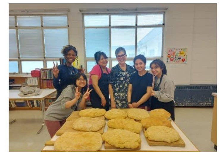
Students were guided through the process of bannock making. This traditional food was shared during teepee storytelling sessions the following day.