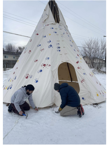
Students had an amazing experience learning about the teepee and how to build it.