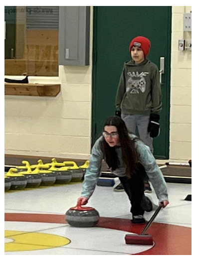
Phys. Ed. 7 and Phys. Ed. 20/30 students enjoyed at trip to the curling rink to learn more about the sport!