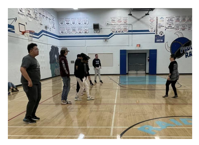
Phys. Ed. 20/30 students started the week with lessons in jigging.