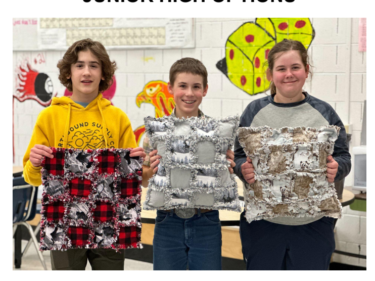
Grade 7 students have been sewing rag pillows in Home Ec. while grade 8 students have been working on various woodworking projects!