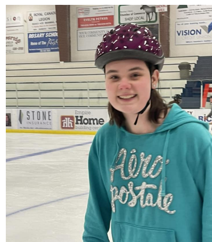
Grade 7-10 students enjoyed a trip to the Jack McAvoy Arena for some indoor and outdoor ice time!