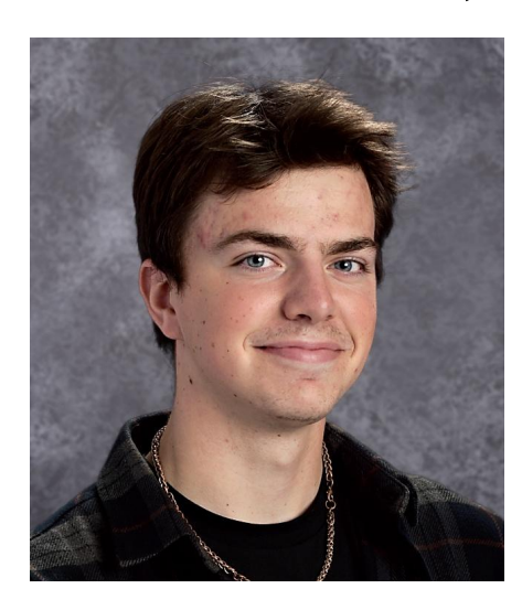
Student of the Year Award recipients are chosen using a formula blending Academics, Athletics and Extracurricular.

Paul Rowe Jr./Sr. High School recently celebrated the academic, athletic and extracurricular achievements of our students at our Awards Day ceremony for the 2021-2022 school year. We are happy to announce that over 70% of our students received recognition for their hard work and dedication in these areas.