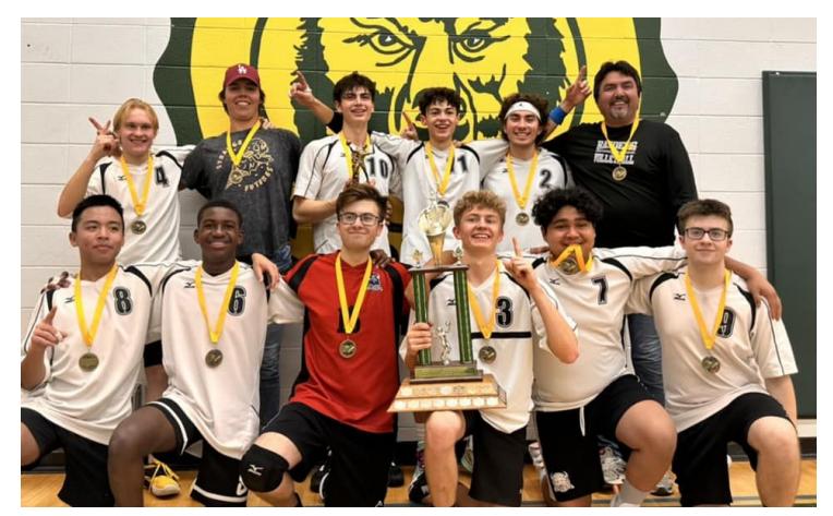
Our senior boys volleyball team won their second tournament gold medal October 29!