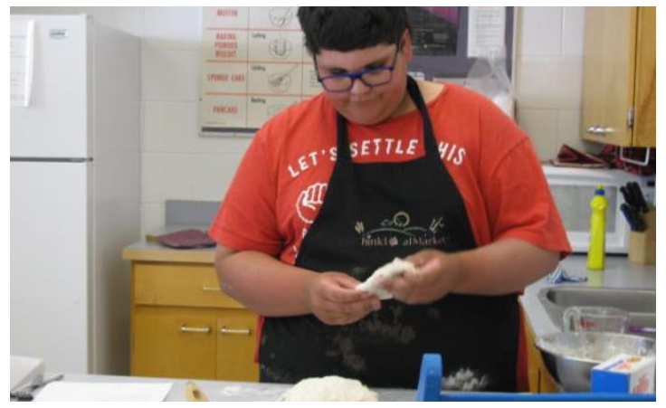
On June 21, National Indigenous People's Day, students visited the Home Ec. Room and learned how to make bannock.