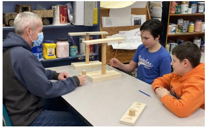
Shop 8 students built and tested tabletop Hook and Ring Toss Battle games.