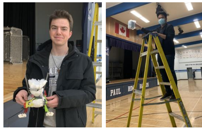
Physics 30 students used the engineering design process for their advanced egg drop lab.