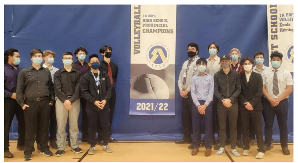
The senior boys' volleyball team capped off an exciting season with an appearance at the 2021 ASAA provincial championships.

After a 2020 season without any competition due to the pandemic, this past season saw the school field three teams: