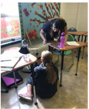
Grade 7 students are studying direction and location of a force in Science class! Here are some pictures of their straw and spring scale experiment!