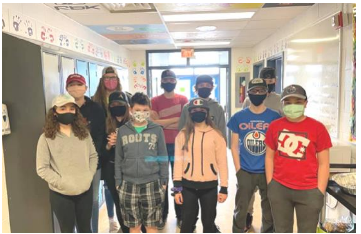
Students put their "Hats On! for Mental Health Day" to raise awareness of good mental health.

Thanks to Community Actions for Health & Well-Being (CAHWB) for the latest shout-outs from Jake Neighbours from Mikael Backlund (Calgary Flames) and Jake Neighbors (Edmonton Oil Kings)!