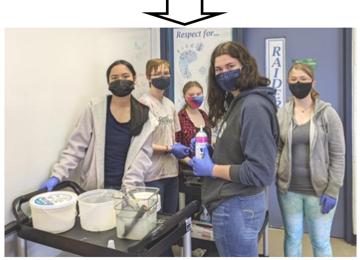
Congratulations to the grade 10-1 cohort for winning the ice cream sundaes from SCOER! This cohort had an astounding 91% class participation in our May formal day!

Check out all of the fun SCOER events that are being planned for June on our school events calendar!