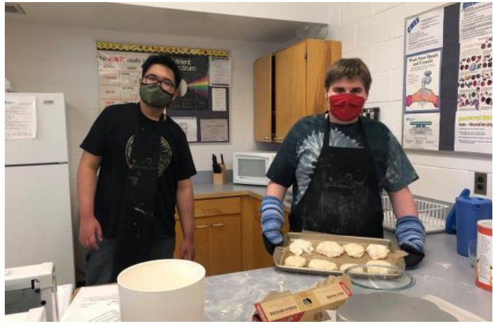
Senior High Foods students jumped right back into in-person learning with a delicious bannock making lesson!

The senior high Psychology class tested each other's memory skills in memory skills stations activity!