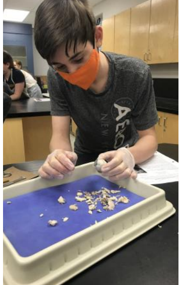
Grade 7 & 8 Science students spent time in the lab dissecting sheep eyeballs as part of their "Body Systems" unit.