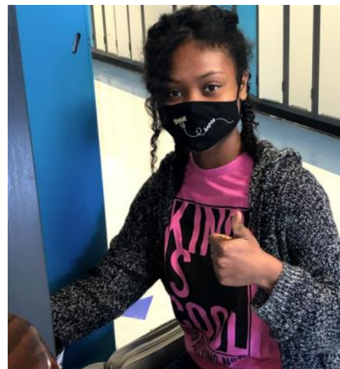
Pink Shirt Day is celebrated annually in schools and communities across Canada.

On February 24th, all Peace River School Division Schools celebrated Pink Shirt Day. At each school, various activities were designed to recognize the importance of healthy relationships, kindness, respect and acceptance. At Paul Rowe, our Pink Shirt Day was planned by our students' union, SCOER.