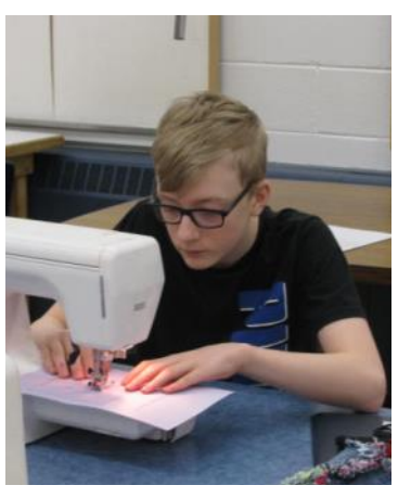
Grade 7 Home Ec. Students learned how to sew, then upcycled jeans to create tote bags.