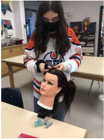
High School Cosmetology students have been busy mastering the art of braiding!