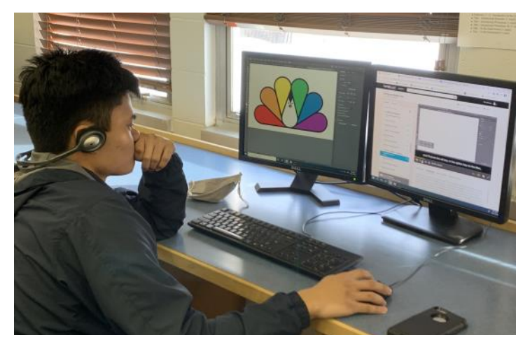
Special Projects students are learning how to create vector graphics using Adobe Illustrator!