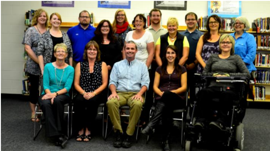
The staff at Paul Rowe welcomed students back for the 2015-2016 school year.

Many Events Planned for September and October